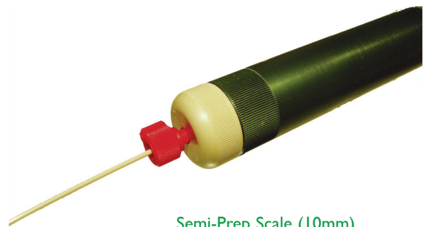
Semi-Prep Scale (10mm)