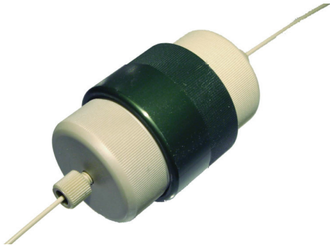
Prep Scale (20mm)

See pages 66 - 67 for information about the Prep and Semi-Prep Cartridge Holders